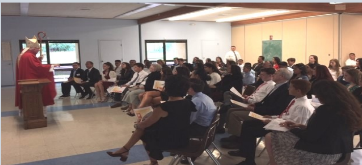
The Bishop in the Hall addressing the Confirmandi.