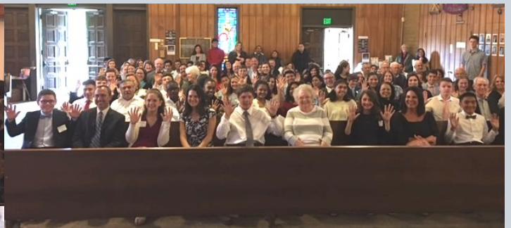
In the church after all were confirmed!