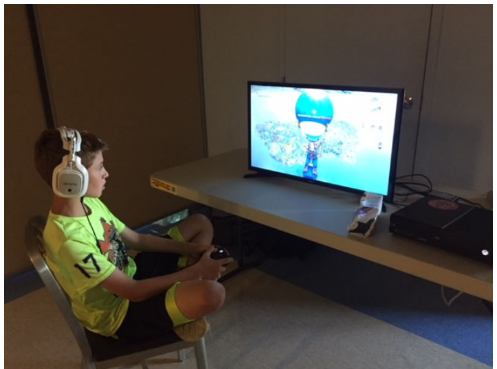
Fun at the Game Night Extravaganza.