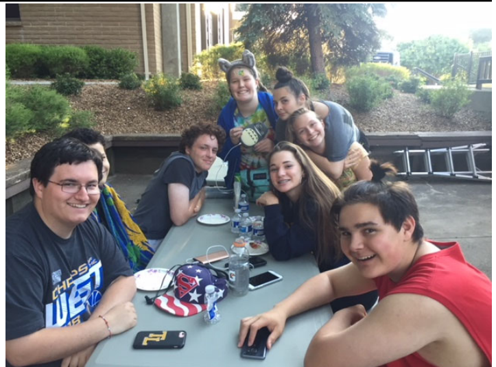
Bonding time with friends!